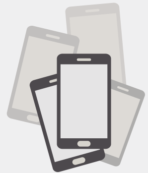
○ GOOGLE AUTHENTICATOR ○