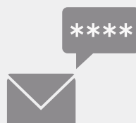
○ PIN-MAILER ○