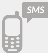
○ SMS & E-MAIL ○