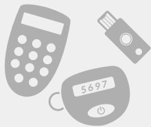
○ HARDWARE TOKENS ○

Choose among a wide range of login devices or the free Google Authenticator